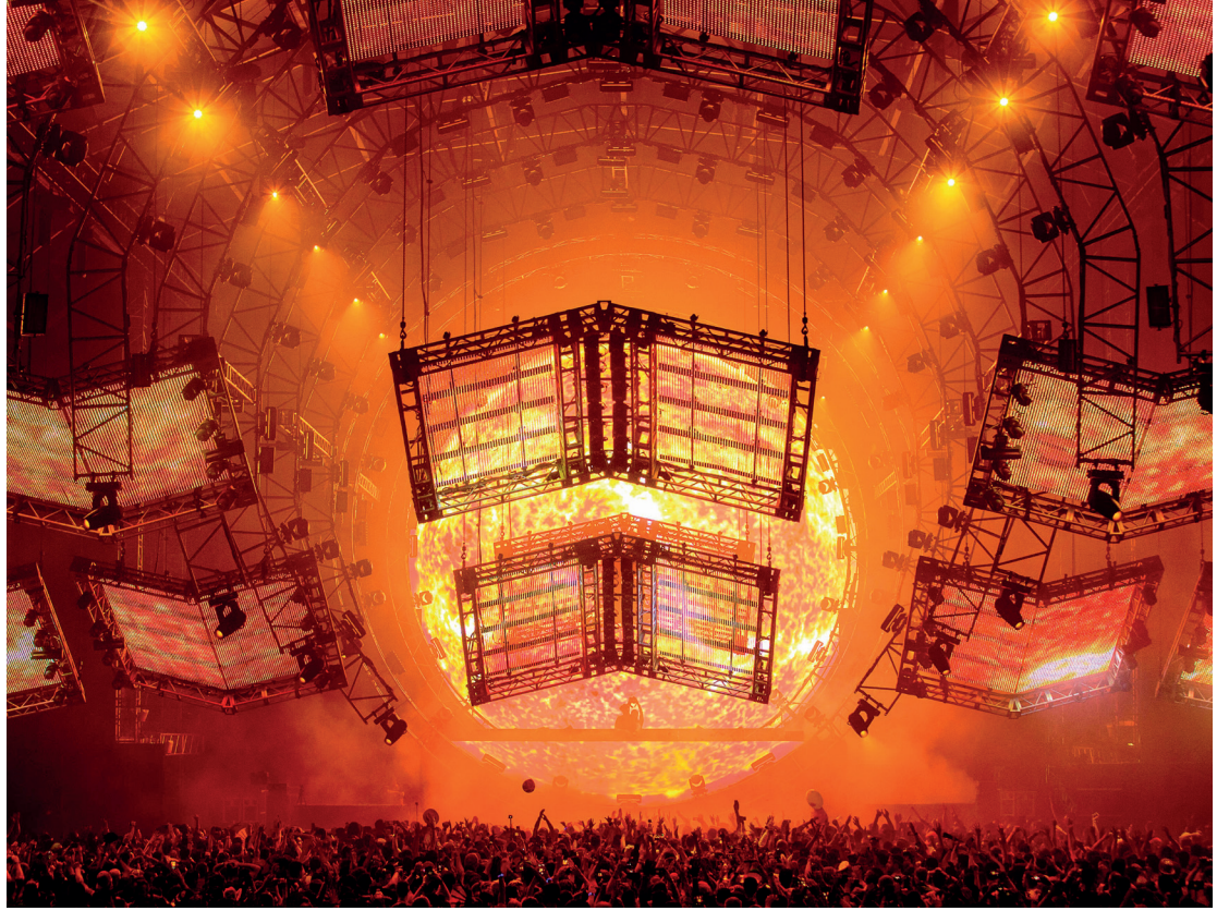
Above: Venues/ Asot The Sun/ Florisheuer