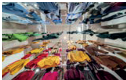
Brand Activations & Experiential Events winner: Noah Goodrich - Hanging on Display - Clothes from UniQlo's latest season are alluringly hung on a display during an activation at Somerset House in London