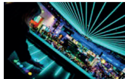
Trade Shows & Exhibitions winner: Kevin Moran – Don't Let The Power Go To Your Head A visitor controls a huge interactive lighting installation at annual gaming innovation showcase ICE London, held at ExCeL